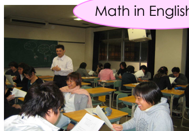
Math in English class

Foreign lectures teach their favorite subjects like science, math, etc. in English. There are six classes, including two classes starting next year.