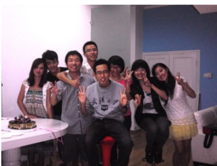
English corner friends celebrated my birthday!!

One year after my determination to study in China, I began to stay at university in Wuhan, located at center of China. Spending 10 months studying there gave me great inspiration. I actively made a lot of international friends beyond nationality, gender and age because I wished to work at United Nation in the future. In addition to the Asian and African students, the students from western countries such as France, Germany, Italy and Canada came to study.