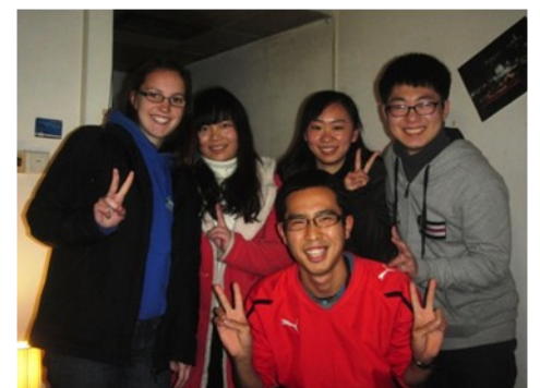
With friends in my dormitory room:D

I have a best Chinese friend whom I knew when I participated in the English activity called English Corner. She has such a great passion that she concentrates on studying even on weekends for accomplish a vivid goal. She said to me that I am the first Japanese friend for her. According to her, I am different from the Japanese in the anti-Japanese drama describing the Japanese as cruel. She also told me that the real Japanese is a calm and attentive and that she was glad to make friends with me. After coming back to Japan, I have kept in touch with her. We promise to meet again in 7 years when Tokyo Olympic will be held. I look forward to seeing her again!!!